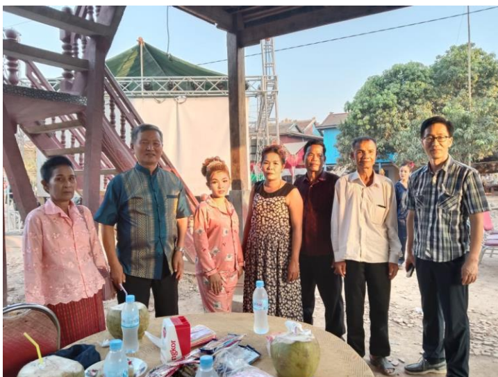
The CEMF candidate evangelism village in Kampong Cham