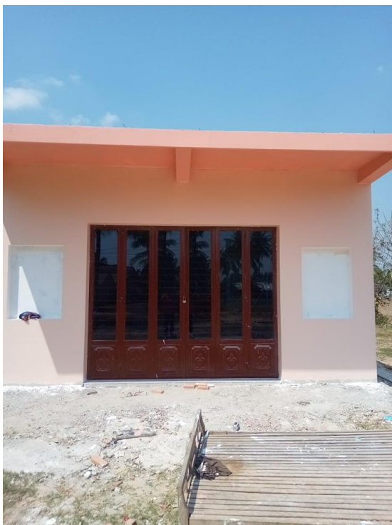
Kampot Prey Samnang Prebyterian Church building Elder Sang Sun Lee memorial Church Dedication Worshiop – April 11 2021