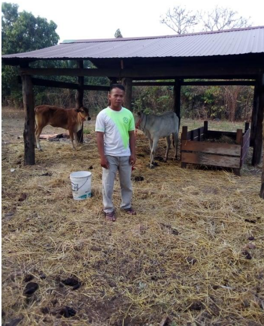
Oordmeanchev bought a cow for feeding ministry