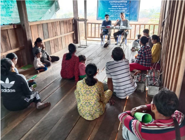
Smat church worship time with One Day revival evangelism school