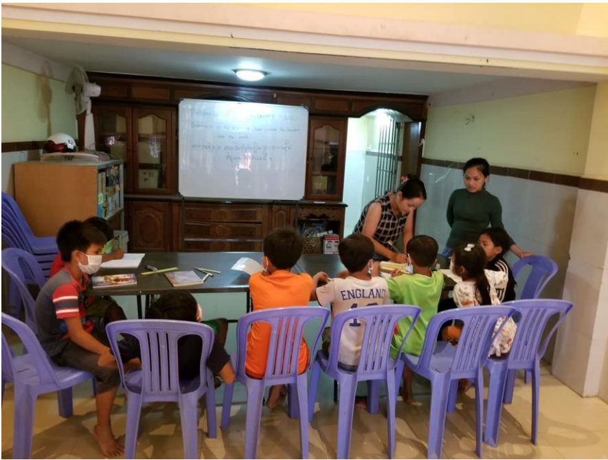
CPPC Week day English Class under Charany and Kaka Da.