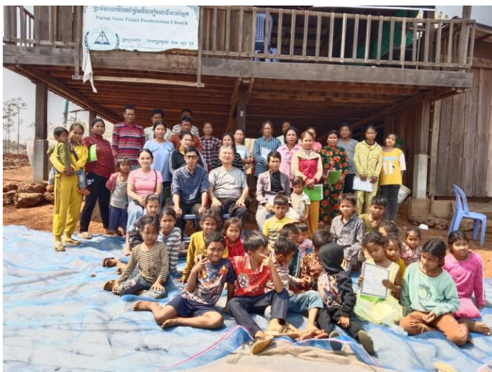
Pursat Smat Peniel Church ODRES ( 20 persons certified)