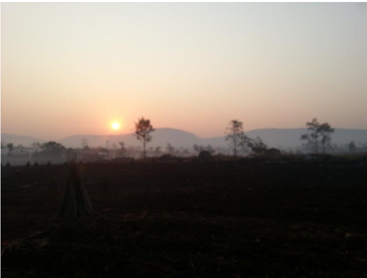
PursatSmat village Sunrise