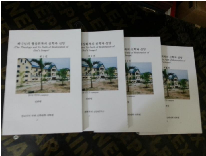
The Theology of the restoration of God's image and Its Faith vols I, II, III, IV