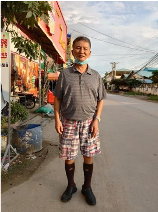
Missionar needs exercise after Lock-down in the village.