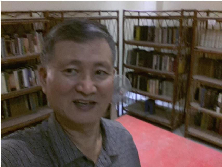
The Small library of Cambodia Reformed Faith Institute