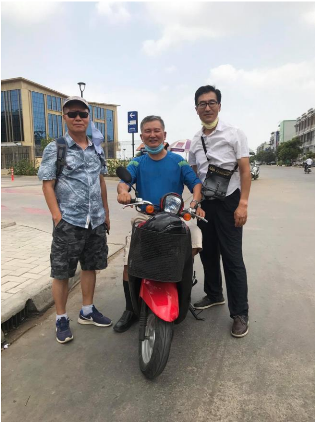
The missionaries in fellowship at Aeon Mall II